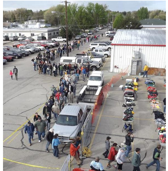
The line waiting for the sale to open.

Last, but not least, this sale could not happen without the incredible help we get from our IWA member volunteers. Thanks again for all of your assistance!