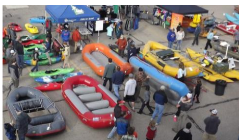
2015 Used Equipment Sale

We are working on putting together the 2015-2016 IWA Calendar of Events schedule, and will be releasing that on the Idaho Whitewater Association website and in the Fall Newsletter. Please check back for additional information.