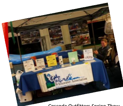
Cascade Outfitters Spring Thaw