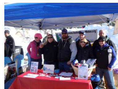
Winter Carnival - McCall