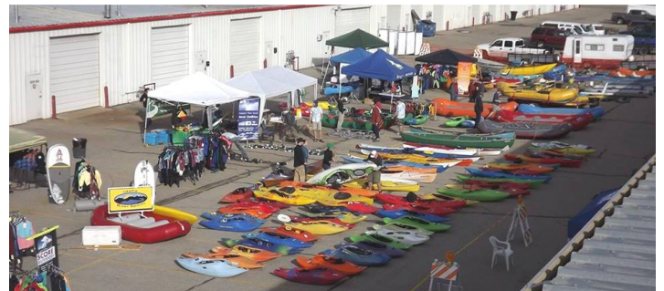
The view from the roof of some of our vendors, kayaks, canoes, and various inflatable's for sale.