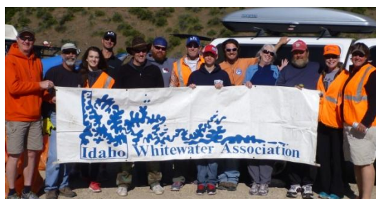
Adopt a Highway - Spring 2015